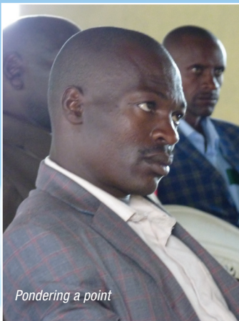
Pondering a point