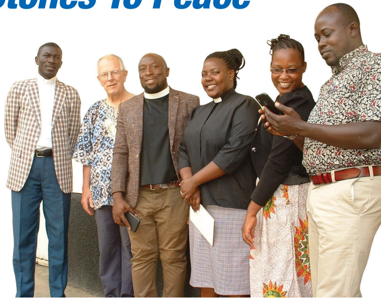
Above: The Bunia Team

The team members faced significant challenges even before they arrived, with struggles over visas, physical attacks, injuries and illnesses affecting relatives and were acutely aware of their reliance on the dedication of their team of intercessors. However despite these challenges the conference took place in the Cité Church, Bunia from Tuesday 19th to Friday 22nd March. The team did not have as many opportunities for group discussion and prayer ministry as they would have