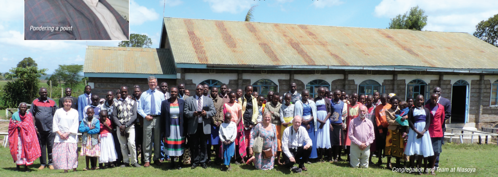
Congregation and Team at Niasoya