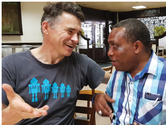
The way that the Holy Spirit has been at work is wonderful

The team ended the day rejoicing and grateful that, as an intercessor had said, their feet 'brought good news'. During the following days of ministry concerning evangelism in the power of the Spirit, marriage, unity and stability in loneliness, there was a