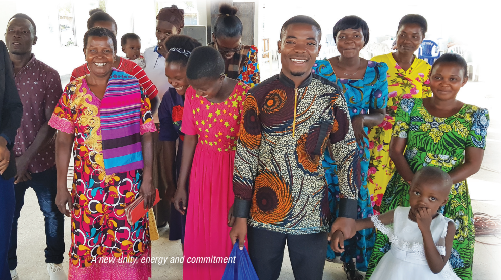
A new unity, energy and commitment