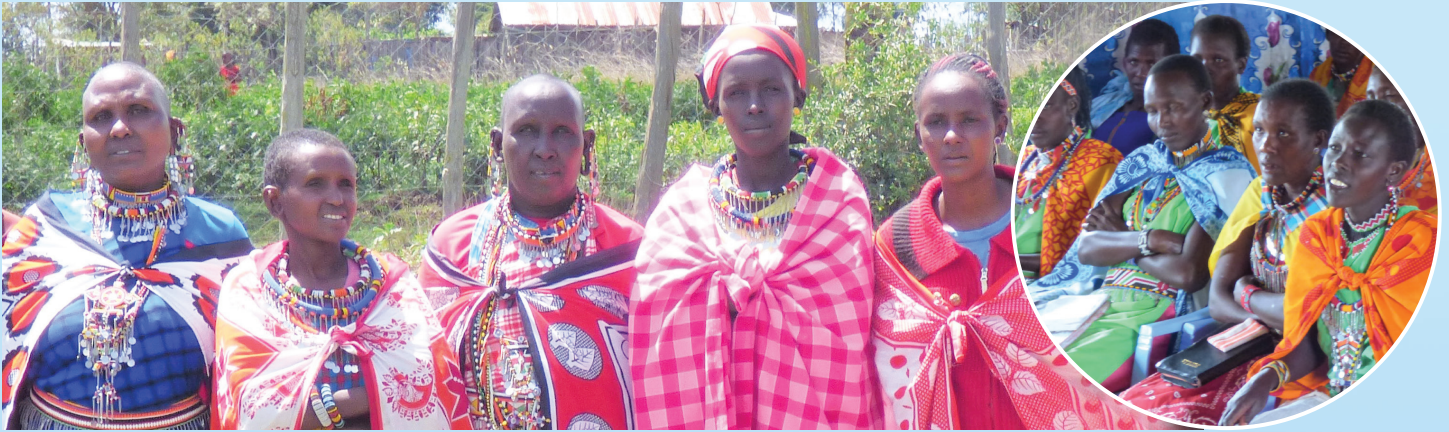
After the Sunday service