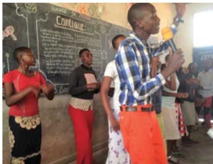
'The people of Rutana are a joyful lot'