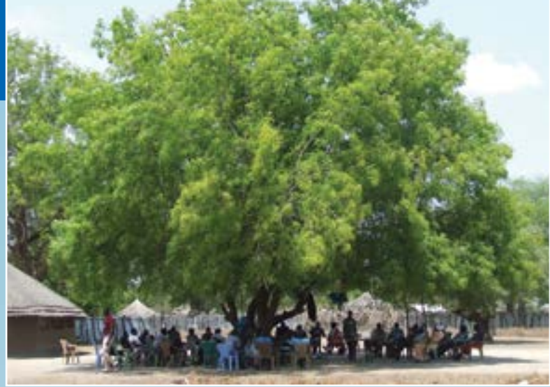
Trees planted by streams of water, ‘whose leaf does not wither’