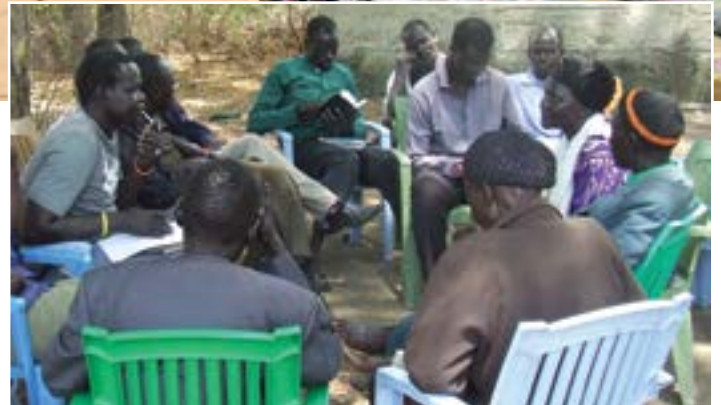
'Blessed is the one whose delight is in the law of the Lord'