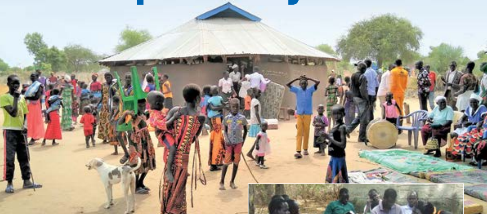
Trees planted by streams of water, 'whose leaf does not wither'

“Blessed is the one who does not walk in step with the wicked, or stand in the way that sinners take, or sit in the company of mockers, but whose delight is in the law of the Lord, and who meditates on his law day and night. That person is like a tree planted by streams of water, which yields its fruit in season and whose leaf does not wither – whatever they do prospers.” Psalm 1: 1-3.