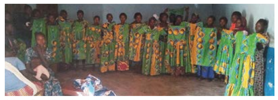
A Kenyan Team will visit the project between 23rd and 28th February

This project which is an initiative of the Youth Department of the Diocese of Boga in Eastern DRC, has started a response to the sexual violence which has been a major element in the insecurity and violence of this part of DRC over the past few years.