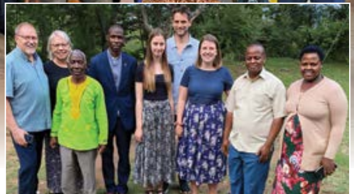
The SOMA team who recently visited Uganda

It was a precious time for the male and female clergy and spouses, many of whom had made complex child-care and